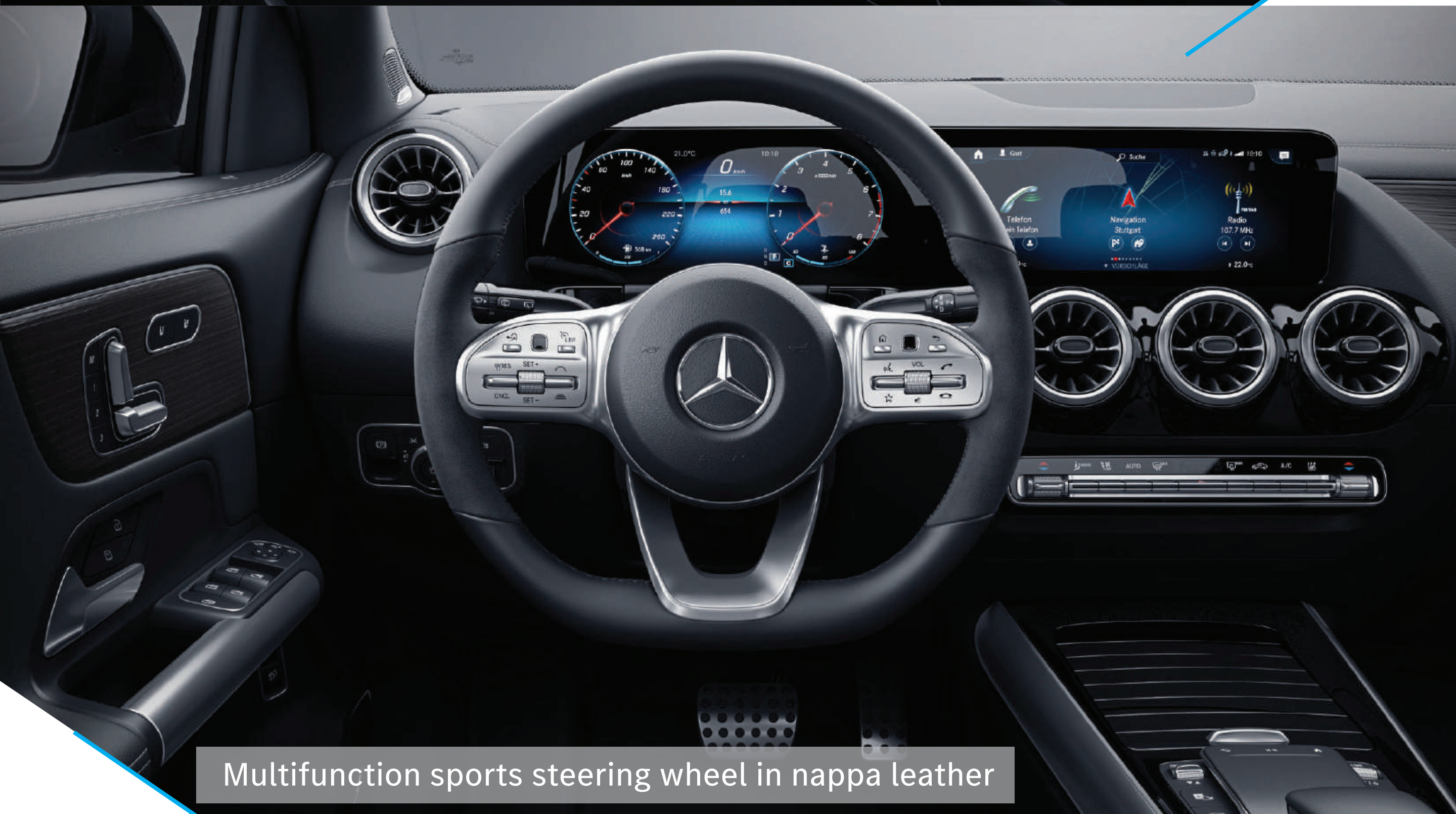
Multifunction sports steering wheel in nappa leather