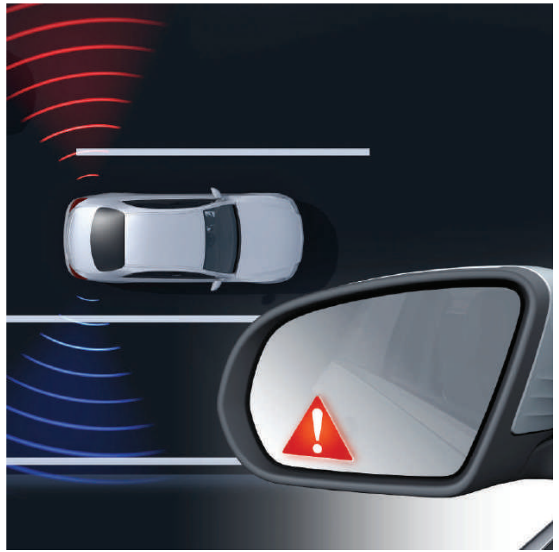
Blind Spot Assist