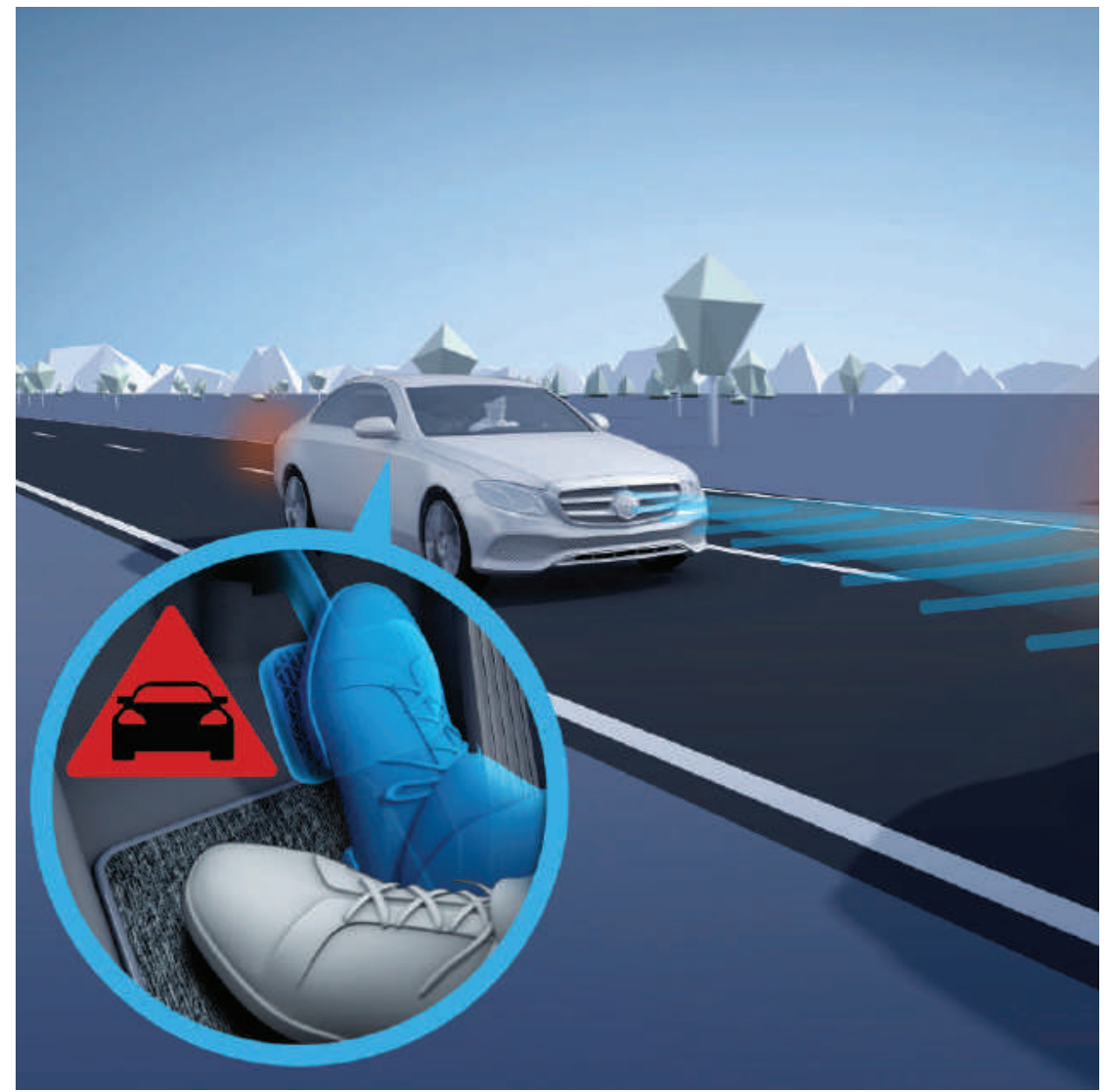
Active Brake Assist